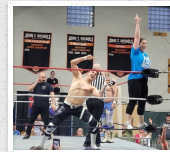
Eros vs. Phillips